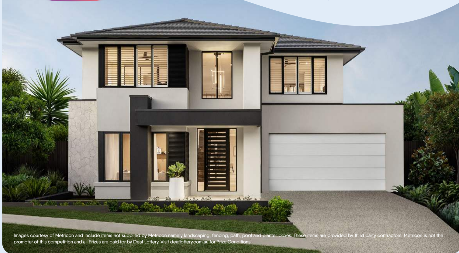
Images courtesy of Metricon and include items not supplied by Metricon namely landscaping, fencing, path, pool and planter boxes. These items are provided by third party contractors. Metricon is not the promoter of this competition and all Prizes are paid for by Deaf Lottery. Visit deaflottery.com.au for Prize Conditions.